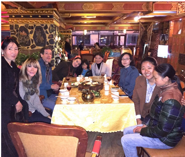
Enjoying a Tibetan dinner in Kangding with several local friends

On November 14 & 15, we spent time with several local friends.